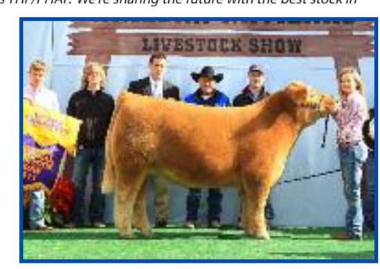
2011 Arizona National Grand Champion Steer

Look for more from HL Donor 419 at Lot 202