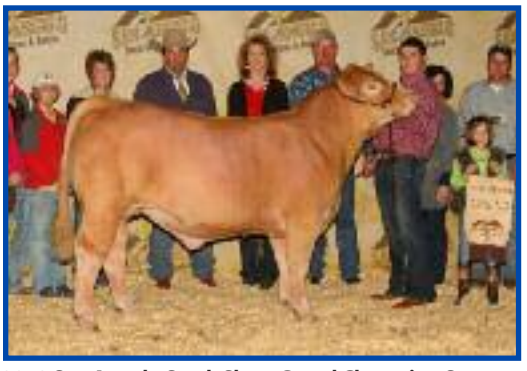
2012 San Angelo Stock Show Grand Champion Steer