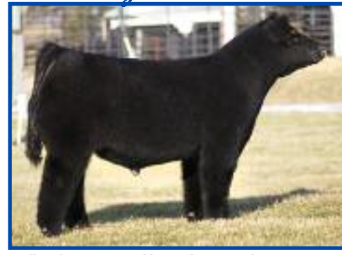
Walks Alone – Owned by Rodgers Cattle Company, IA Heat Wave x Draft Pick x Full Flush x Chill 602G