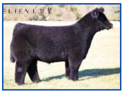
Believe In Me – Owned by Rodgers Cattle Company, IA Heat Wave x Draft Pick x Full Flush x Chill 602G