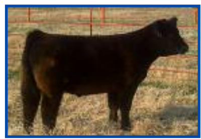
Solid Gold x Lot 20

From the same foundation cow family as the popular sires, Benny and Blanco, here is the dam of a $15,000 Solid Gold son that ranked at the top of the 2010 crop at Horn Livestock and recently stood second in class at Oklahoma City. The success of this cow stems from her second dam, the famous Charolais 1 donor, that produced well until 20 years of age. This beauty is horse-necked with plenty of horsepower yet still THF/PHAF, and you'll be Lovin' the Business when she delivers a full sibling to the beautiful silver daughter she had last fall! Horn Livestock