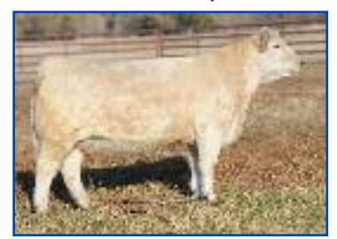
GK 911 – The $46,500 sister to Stud Monkey