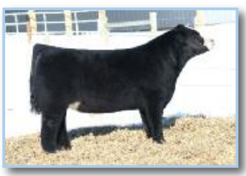
Simple Math Made Who x GK Donor H-832 (Meyer 734 x GK Angus 602) Tested THF/PHAF – Owned by Kroupa Genetics and Boysel Genetics – Semen Available Sale Day at $20/straw