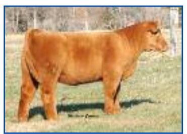
A $30,000 daughter of Stud Monkey