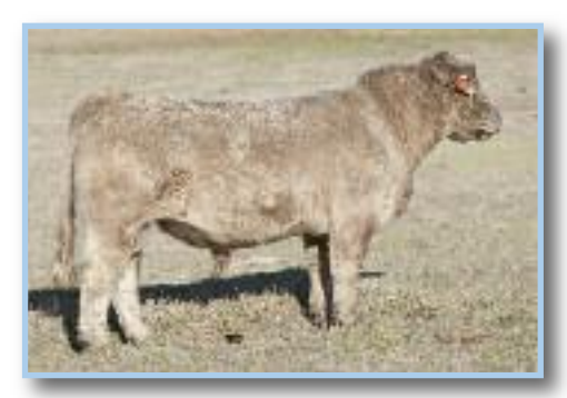
Lovin' the Business Yellow Jacket x Shamrock x Angus/Meyer Tested THF/PHAF – Owned by Horn Livestock