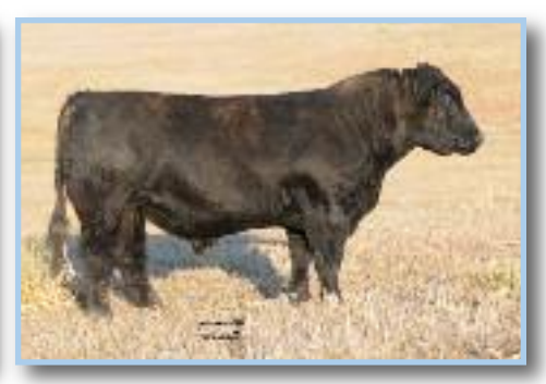
GK No B.S. Dirty Harry x Cunia 602 x Covino III Tested THF/PHAF