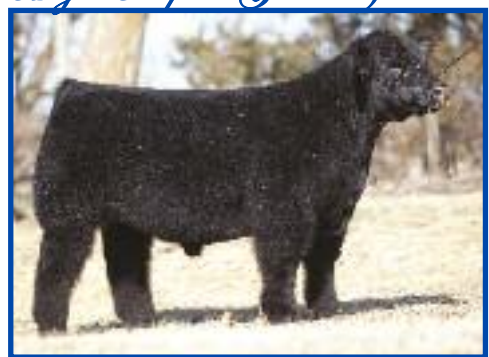
The Creature – Owned by Goddard Cattle Company, IA Walks Alone x Ali x Full Flush x Chill 602G A full sister to his dam sells as Lot 4!

High-Impact Genetics from the 602 Family!