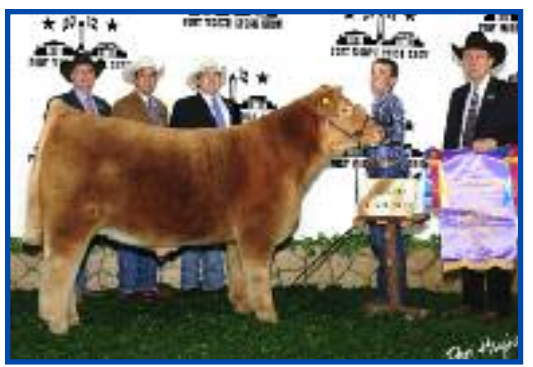
2012 Ft Worth Stock Show Grand Champion Steer