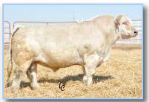
GK Stud Monkey Chunky Monkey x GK Miss Outlaw M-51 (Thomas Outlaw x GK Donor G-1) Tested THF/PHAF – Owned by Kroupa Genetics Semen Available Sale Day Only at Lot 300