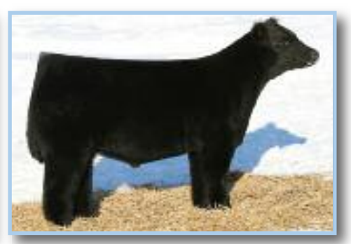
Damage Control Ringer (Ali x Kadabra) x Heat Seeker